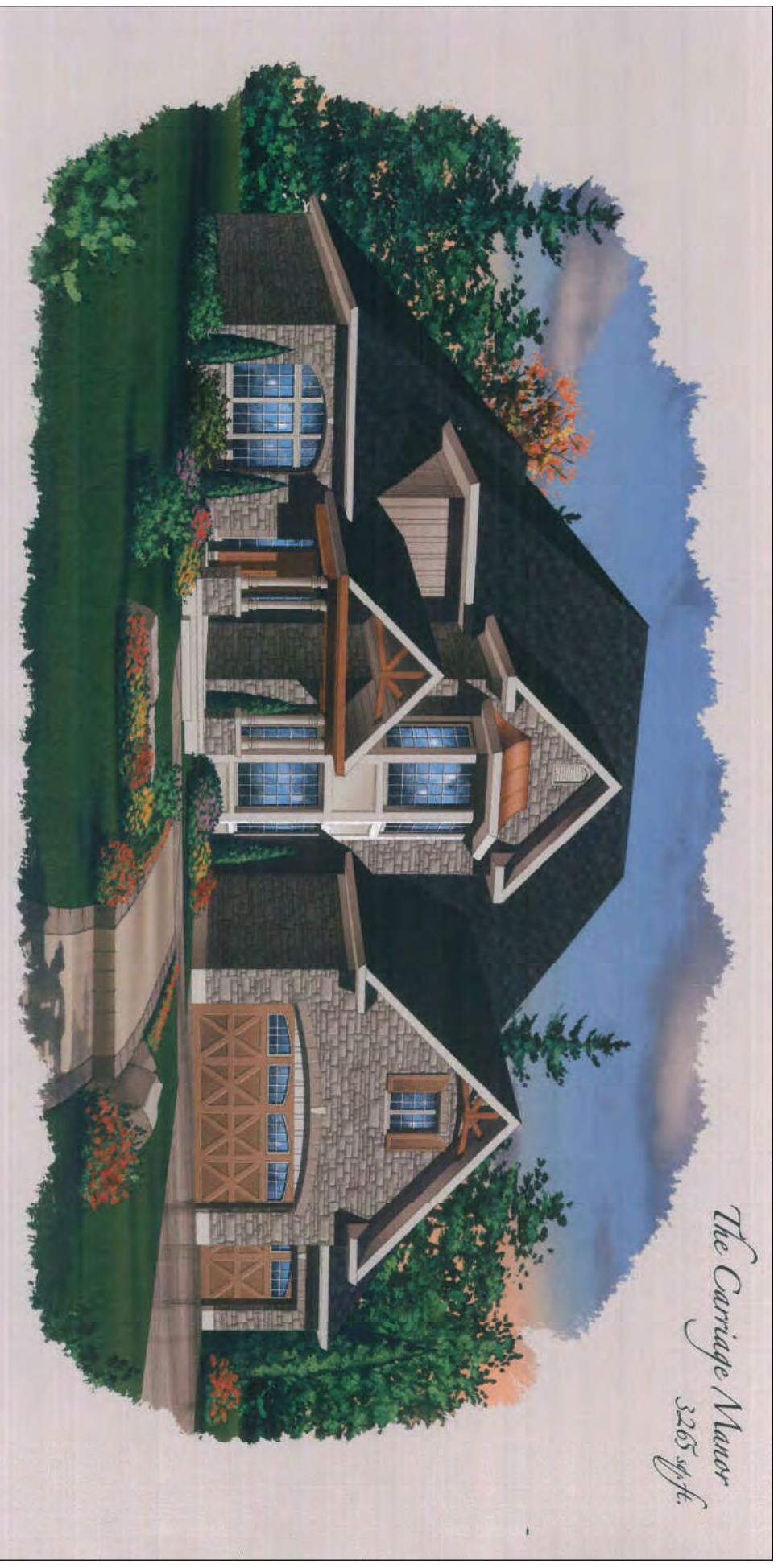
Figure 31 : Typical Dwelling Elevation, Bridlewood Estates